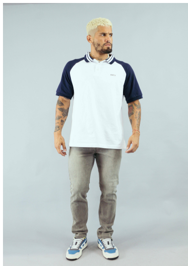
SSH-JLST816 MENS STRAIGHT JEANS