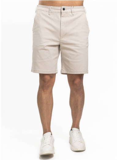
SSH-SHT260 CASSUAL SHORTS