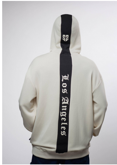
SSH-HDY006 LONG T-SHIRT WITH HOODI E