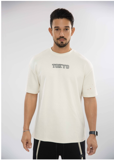
SSH-OVS302 OVER SIZE T-SHIRT