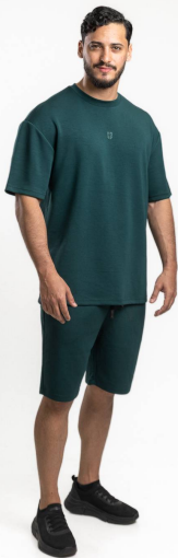
SSH-SET333 OVERSIZE SET