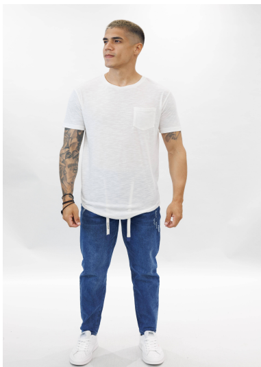
SSH-JL9SM003 MENS 90S JEANS LONG PAN TS