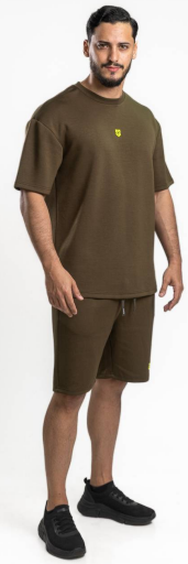
SSH-SET332 OVERSIZE SET