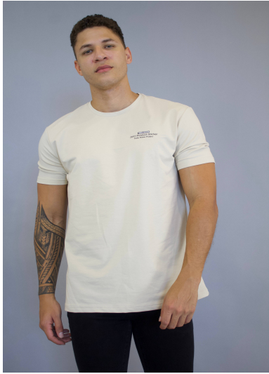
SSH-TSP301 MENS S/S T-SHIRT