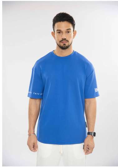
SSH-OVS304 OVER SIZE T-SHIRT