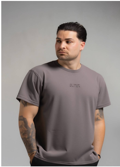
SSH-OVS367 OVERSIZE T-SHIRT