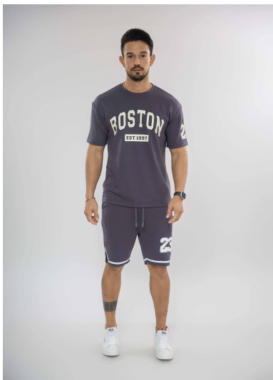
SSH-SET222 OVER SIZE SET