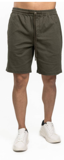
SSH-SHTC264 CASSUAL SHORTS