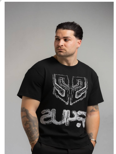
SSH-OVS364 OVERSIZE T-SHIRT