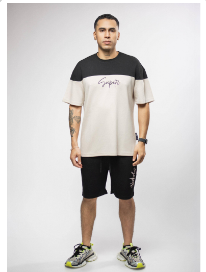
SSH-SET250 OVER SIZE SET