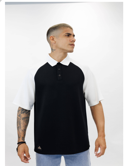
SSH-OVS282 OVER SIZE POLO SHIRT