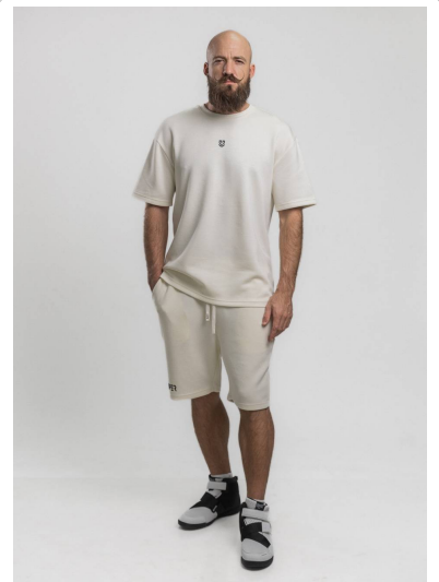
SSH-SET329 OVERSIZE SET