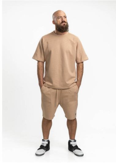
SSH-SET325 OVERSIZE SET