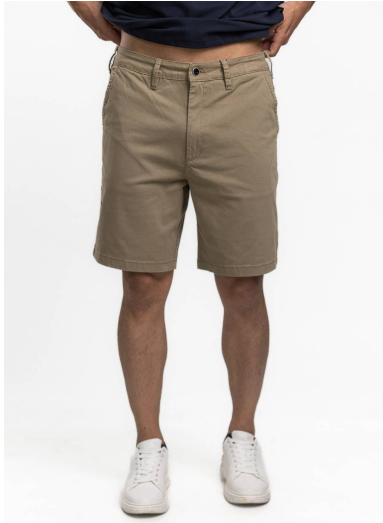
SSH-SHT259 CASSUAL SHORTS