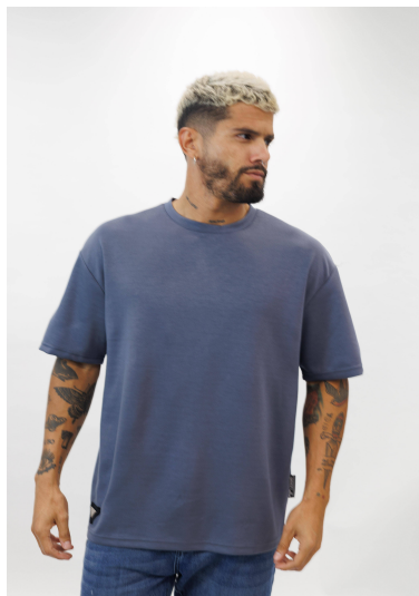
SSH-OVS274 OVER SIZE T-SHIRT