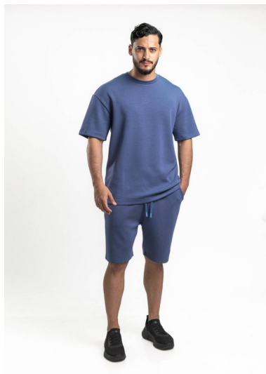
SSH-SET328 OVERSIZE SET