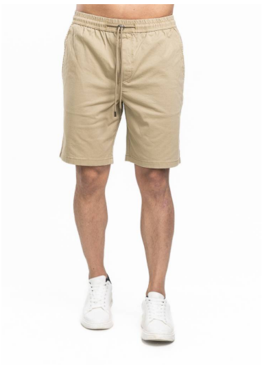
SSH-SHTC263 CASSUAL SHORTS