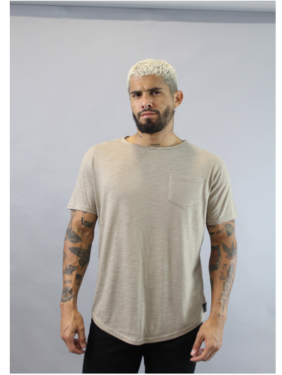
SSH-TSP315 MENS T-SHIRT