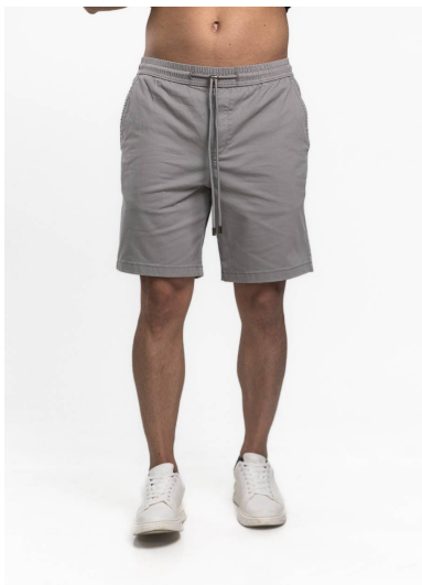
SSH-SHTC262 CASSUAL SHORTS