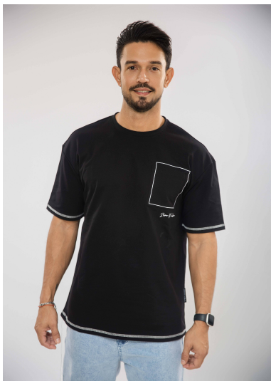
SSH-OVS315 OVER SIZE T-SHIRT