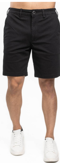
SSH-SHT257 CASSUAL SHORTS