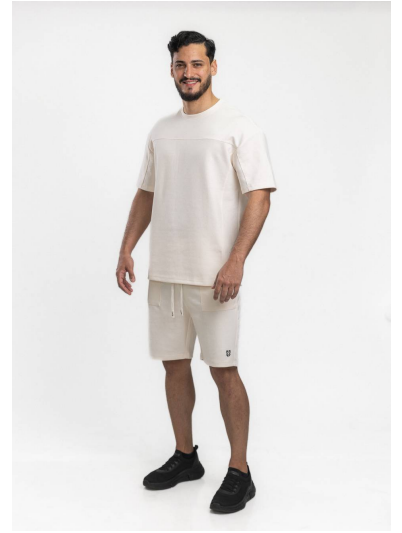
SSH-SET326 OVERSIZE SET