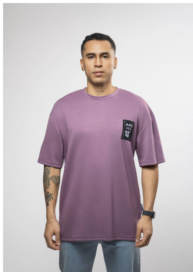
SSH-OVS342 OVER SIZE T-SHIRT