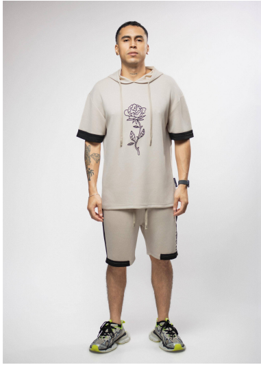
SSH-SET253 OVER SIZE SET