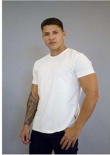
SSH-TSP304 MENS S/S T-SHIRT