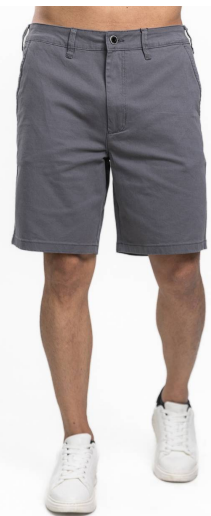
SSH-SHT258 CASSUAL SHORTS