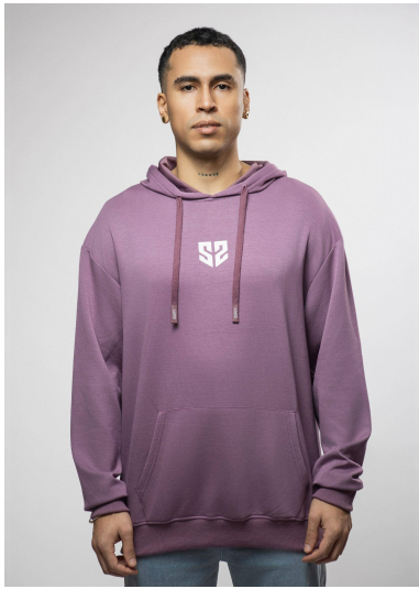
SSH-HDY005 LONG T-SHIRT WITH HOODI E