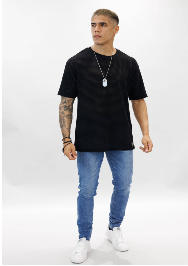
SSH-JLSY851 SUPER SKINNY MAN