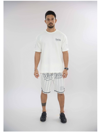
SSH-SET221 OVER SIZE SET