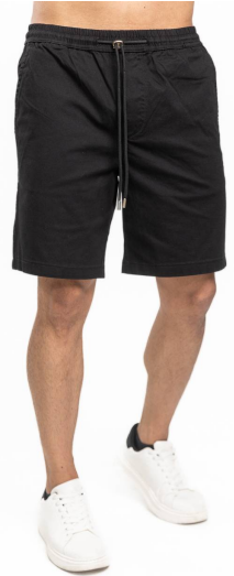
SSH-SHTC261 CASSUAL SHORTS