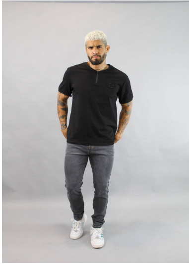
SSH-JLSY826 MENS SUPER SKINNY JEAN S