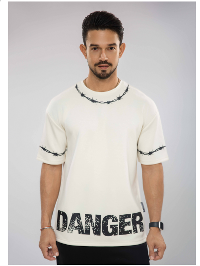
SSH-OVS307 OVER SIZE T-SHIRT