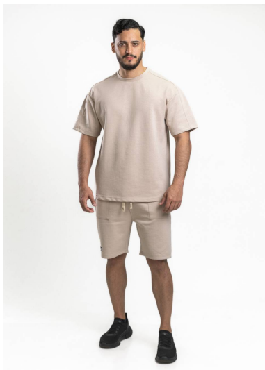
SSH-SET327 OVERSIZE SET