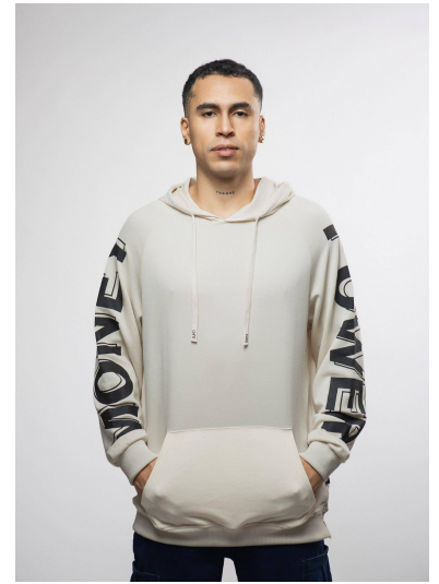
SSH-HDY008 LONG T-SHIRT WITH HOODI E