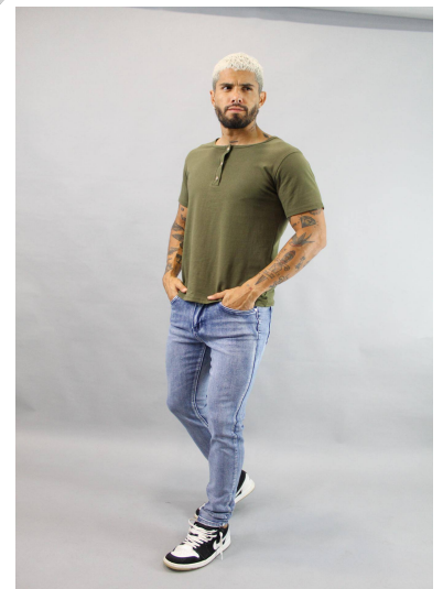
SSH-JLSY824 MENS SUPER SKINNY JEAN S