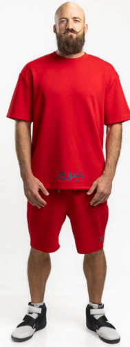
SSH-SET331 OVERSIZE SET