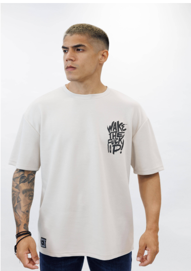
SSH-OVS267 OVER SIZE T-SHIRT