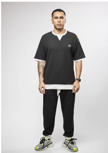
SSH-SET235 SET S/S SHIRT-TROUSERS