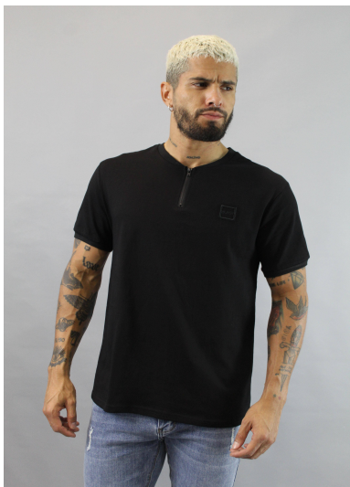
SSH-TSP317 MENS T-SHIRT