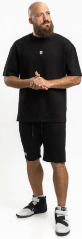
SSH-SET330 OVERSIZE SET