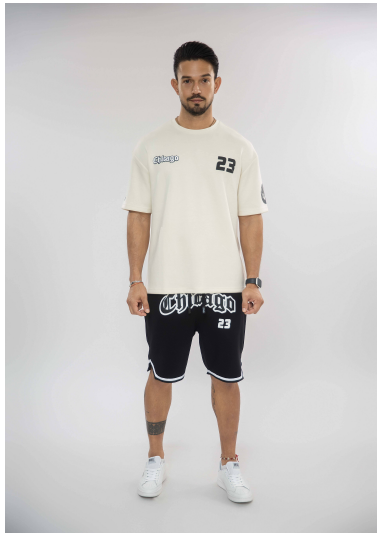
SSH-SET220 OVER SIZE SET